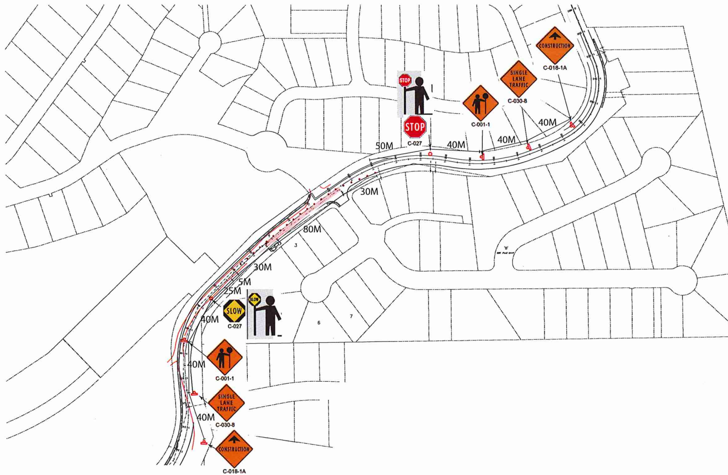
Figure 7.8 Lane Closure with TCPs – Single Lane Alternating – Short and Long Duration NTS